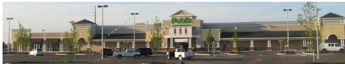
Publix - Ovation - Davenport, FL