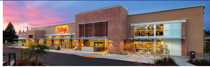
Raley's - Sacramento