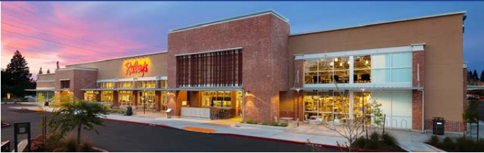
Raley's - Sacramento

Armstrong Development Properties, Inc is a fully integrated real estate development and management company that provides solutions on a local, regional and national scale. Throughout the nation, Armstrong has developed strategic alliances with market leading design consultants who share a business philosophy paralleling that of our company. By partnering with these design consultants, Armstrong's fully-integrated development team can provide specialized services for your project including: